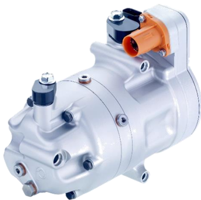
Electric Air Conditioning Compressor

For speed-controlled systems such as electrically driven air conditioning compressors or secondary air pumps, Pierburg develops sensorless control algorithms that ensure robust and highly efficient operation of the electric motor. The PUMA development platform offers optimal conditions for this in the area of pre-series development and is an integral part of the mechatronic product development. In addition to the variants PUMA-MPI and PUMA-PTM with integrated power stages, Pierburg also uses the variant PUMA-PSI for controlling specially developed power stages, for example for electrical high voltage drives.